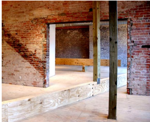
JOHN WATSON, details from "Better now than they once was," drawings and site specific installation at 1341 H Street,- NE